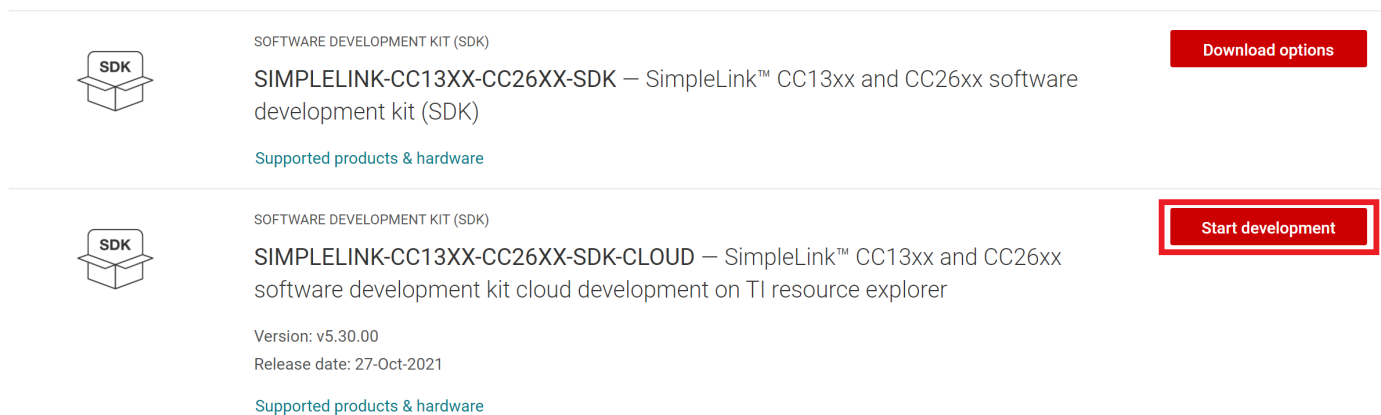
Figure 3-2. Resource Explorer Start Development Button