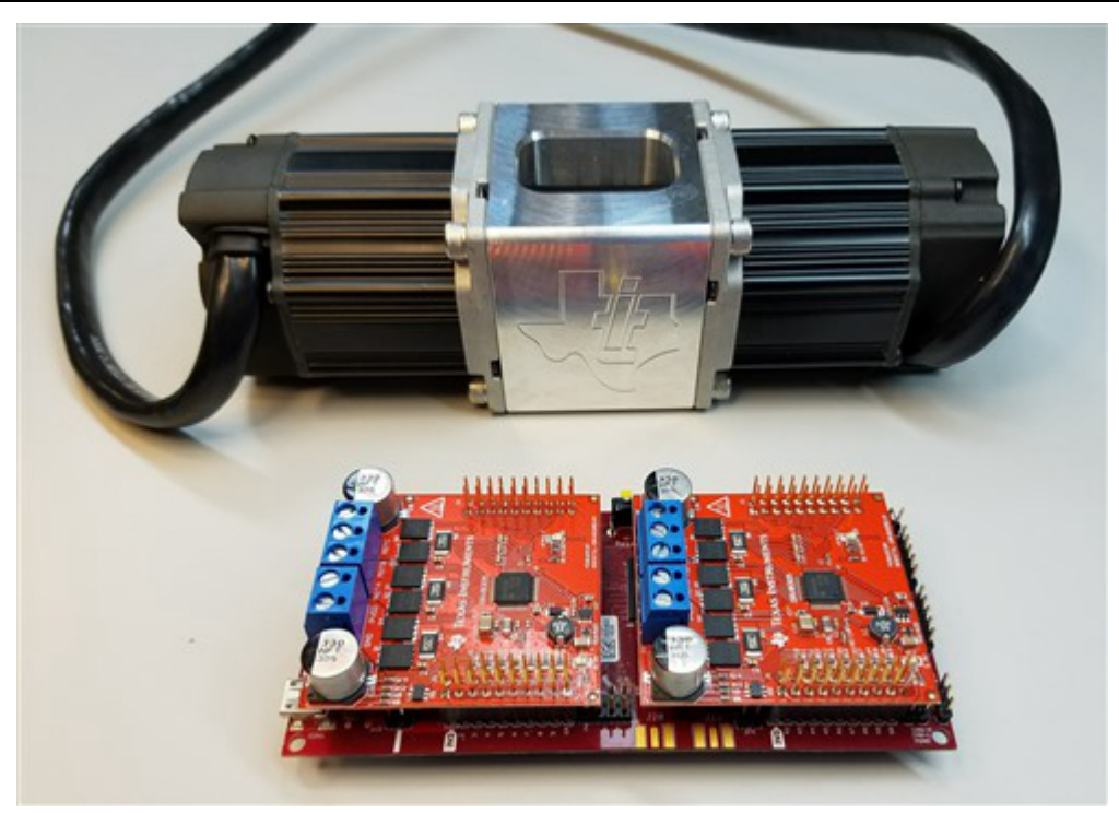
Figure 4. A Low-cost, Shunt-based Sensing Bundle for Motor-control Performance Testing