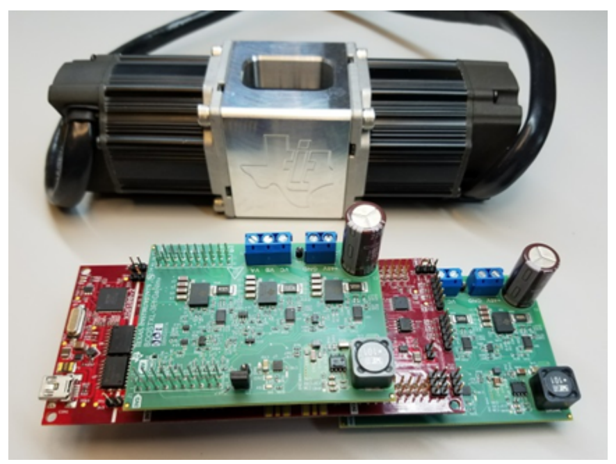
Figure 3. A Low-cost GaN-based Bundle for Motor-control Performance Testing

Available for less than $600, this is the same configuration that produced the test results shown in Figure 2. The inverter BoosterPack development boards included in this bundle also include the in-phase current sensing, and therefore enable double sampling of the current per PWM period.