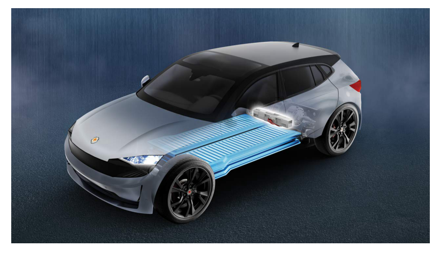
Figure 1. Typical BMS and battery in an EV

While demands for higher levels of BMS reliability have increased, so has the need for faster development cycles. Given the complexity of these types of systems, OEMs are seeking closer collaboration with system developers, semiconductor companies and their third-party partners to streamline development. Figure 1 shows an example of an electric vehicle (EV) BMS.