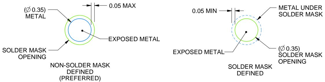
SOLDER MASK DETAILS NOT TO SCALE